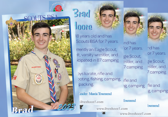
Scout Trading Cards