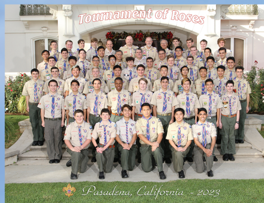
Scout BSA Troop