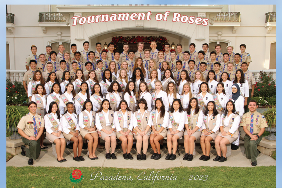
All Troop Print